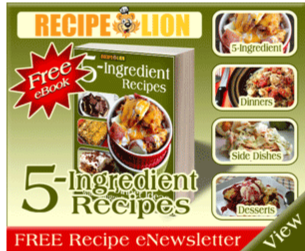
21 5-Ingredient Recipes