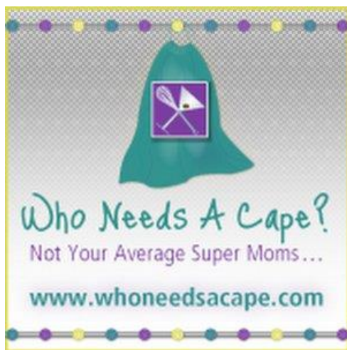
Lori from Who Needs a Cape?