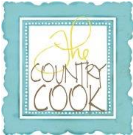
Brandie Skebinski from the Country Cook