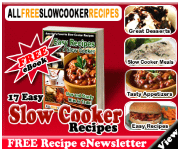
17 Easy Slow Cooker Recipes