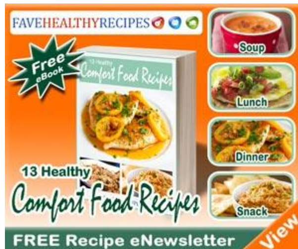
13 Healthy Comfort Food Recipes