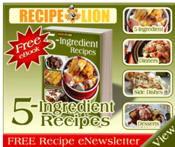
21 5-Ingredient Recipes